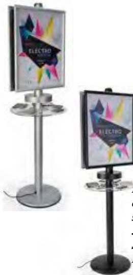
Double sided or single sided charging station with customizable signage RENTAL In black or silver. Single $180.00 Double $250.00