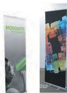
Retractable Banner Stand Can be used over and over. Easy set-up. Graphics included in price. 32" x 82" Includes Carrying Case $185.00