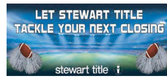
Our 2' x 6' booth horizontal banner can hang on the back of your booth. Single-sided with grommets for hanging. Banner material is heavy duty 13oz. Can be reused over and over. $95.00