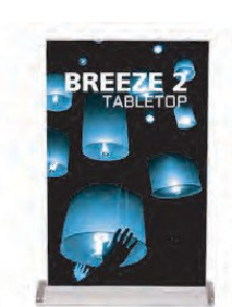
Retractable Mini table top Banner Stand Can be used over and over. Easy set-up. Graphics included in price. 11" x 17" $40.00

ALL CANCELLATIONS FOR ITEMS ORDERED MUST BE MADE 5 BUSINESS DAYS BEFORE THE EXHIBITOR MOVE IN DATE TO RECEIVE A FULL REFUND. ITEMS CANCELLED AFTER THE 5 BUSINESS DAYS, BUT THE DAY BEFORE THE EXHIBITOR MOVE IN DATE WILL BE SUBJECT TO A RESTOCKING FEE OF 50% WITH A MINIMUM OF $50. ANY ITEMS DELIVERED TO THE SHOW SITE (usually 1 - 2 days before vendor move in) OR ITEMS REQUESTED TO BE REMOVED BY THE SHOW REPRESENTATIVE FOR ANY REASON WITHOUT PRIOR CANCELLATION WILL BE CHARGED AT FULL PRICE EVEN IF REFUSED AT BOOTH. PRINTED MATERIALS ARE NOT REFUNDABLE AFTER PROOF APPROVAL.