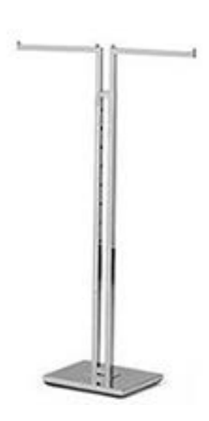
Adjustable T-Rack/ Bag Holder